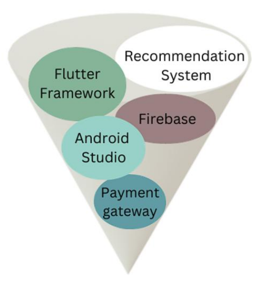
FIGURE 2: PROTOTYPE COMPONENTS

The user interface will feature essential components, such as navigation bars, forms for user input and service listings which can be built with Flutter framework. User authentication will be simulated to showcase the security and personalization aspects of the application. Additionally, it will exhibit the integration of Firebase for backend services, demonstrating real-time data synchronization, data storage, and authentication. It will have a recommendation system to recommend the services to the user.